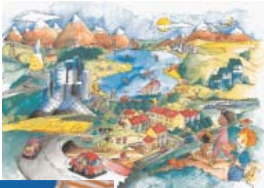
Zinc is Everywhere