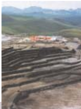
Red Dog Mine