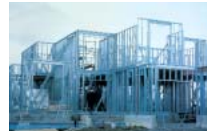
Zinc Coated Steel Frame Housing

Recent advances in medical science are revealing the importance of zinc for the proper functioning of the immune system, the transfer of nervous signals, the expression of genes and many other vital functions. Zinc supplementation is proving successful in the fight against major causes of child mortality such as diarrhea, pneumonia and malaria. Zinc is known to be vital to the functioning of more than 300 enzymes in the human body. Research is also showing, however, that as much as half the world's population is at risk from zinc deficiency, with even greater numbers at risk in developing countries and among poor populations. Zinc supplementation is proving to be an effective and cheap intervention that can greatly improve the health status of groups at risk.