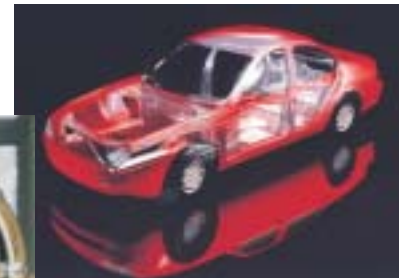
Ultralight Steel Auto Body (ULSAB)