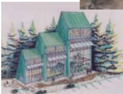
Kortright Centre for Sustainable Living