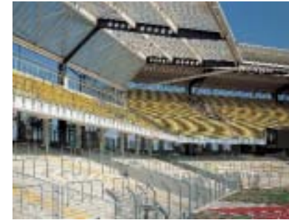
Hot Dip Galvanizing

Today, over 30% of the global zinc supply comes from recycled zinc, recovered from both new and old scrap. 80% of all the zinc used today will be recycled sooner or later. Due to the long life span of many zinc products – over 100 years in some cases – much of the zinc used in the past is still in service. Zinc recycling technology is advancing and the supply of zinc available for recycling is growing too. Zinc can be recycled indefinitely, without loss of its physical or chemical properties, thus constituting a valuable and sustainable resource for future generations.